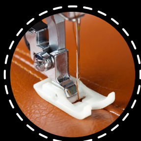
5 mm LEATHER