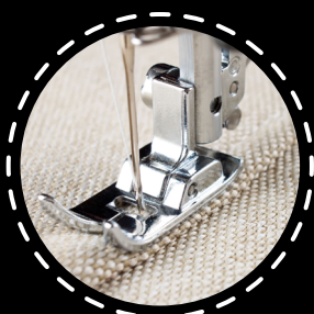
6 mm CANVAS