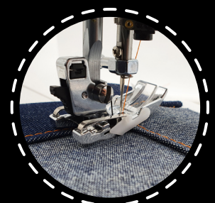
6 mm JEANS